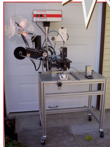
Tap on Combina labeler with table operator product positioning