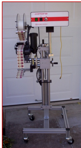
Top applicator Combina labeler with adjustable stand for conveyor use